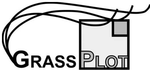
Fig. 1. GrassPlot logo developed by Iwona Dembicz. It links the Stipa awns (reminiscent of the EDGG logo) to the multi-scale sampling approach of precisely delimited plots.

During an international workshop in Bayreuth in March 2017, the database was formally established with the name “GrassPlot” as a collaborative initiative within the EDGG (see http://bit.ly/2BIHmnq ; logo in Fig. 1). The Data Property and Governance Rules (Bylaws) of GrassPlot (Supplement S1) have been set up to balance the interests of data providers and data users in a fair and transparent manner. In particular, data contributors remain owners of their data, are informed about any plans to use their data and can opt-in as active co-authors of papers. Depending on the size and complexity, a dataset in GrassPlot can have one or several owners. The GrassPlot Consortium is made up of these data owners and the 17 participants of the initial GrassPlot workshop. The Consortium elects the Governing Board every two years. The current Governing Board consists of J. Dengler (as Custodian), I. Biurrun (as Deputy Custodian) as well as T. Conradi, I. Dembicz, R. Guarino and A. Naqinezhad (as other members). It is responsible for managing GrassPlot and for handling data requests as well as offering co-authorship under the Bylaws. Paper proposals can be submitted only by members of the GrassPlot Consortium or by author teams at least comprising one Consortium member.